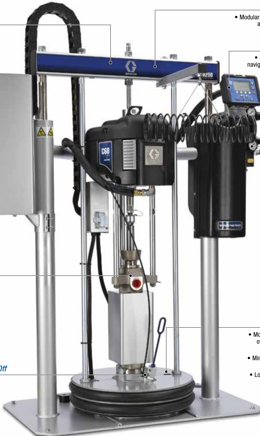
Graco Warm Melt Supply System