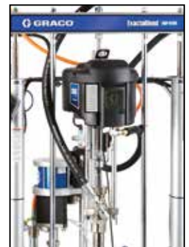
ExactaBlend AGP U100 for Urethanes