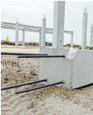
Dowel bar anchoring