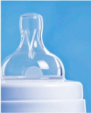
General product assembly